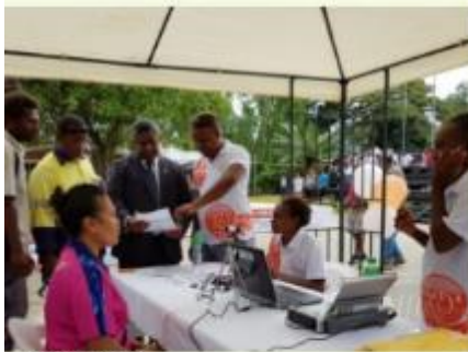
Launching of BVR