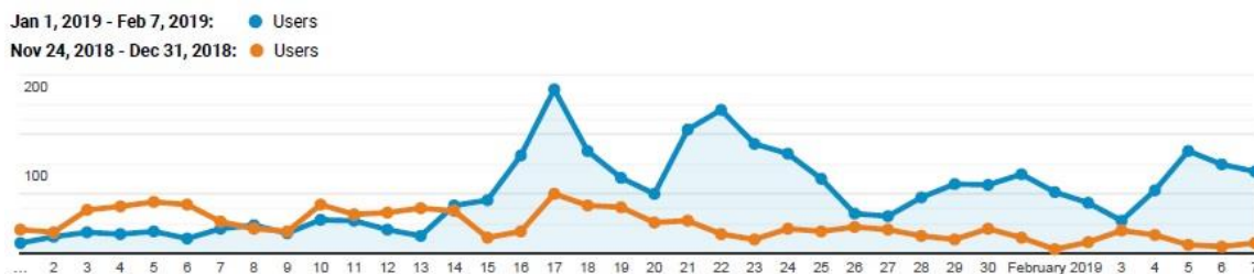
Graph 1: Gradual increase of website visitors

The project engaged a national firm to conduct a comprehensive upgrade of the EO institutional website resulting in a more user friendly, interactive and secure site. The new site includes a search engine providing key information for the electorate to confirm names and ID numbers included in the final voters lists. This has resulted in a substantial increase of traffic and enhancement of transparency and accessibility of voter information.