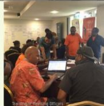
Training of Returning Officers

*Following the request of the national authorities, UNDP launched its electoral assistance project (SECSIP I, July 2013-June 2017). This was followed by a successive project (SECSIP II, July 2017 to June 2020) to support the enhancement of the national electoral capacities in preparation for the 2019 general elections and post electoral activities.