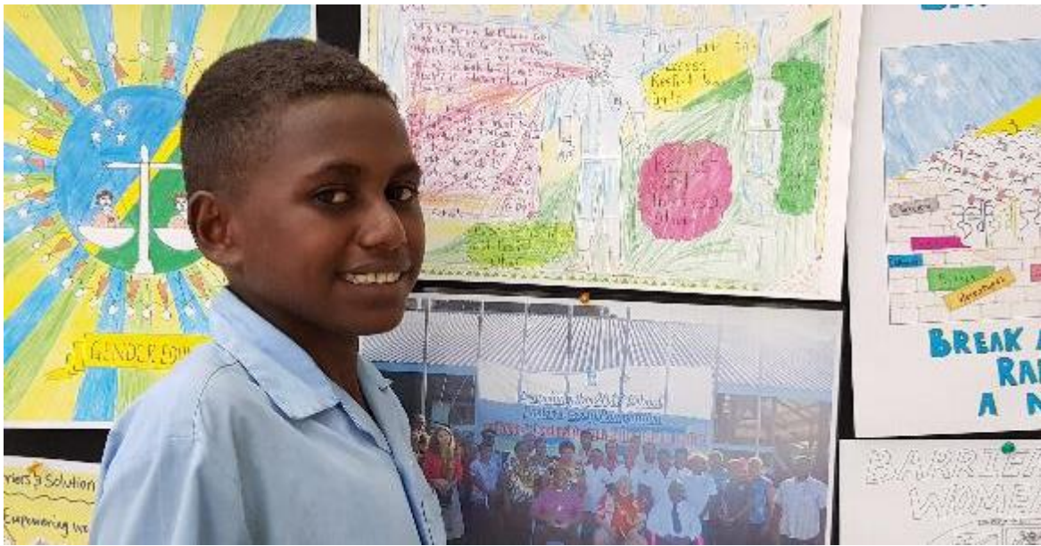
Pic 04: A winner from Poster Competition (Junior student category)