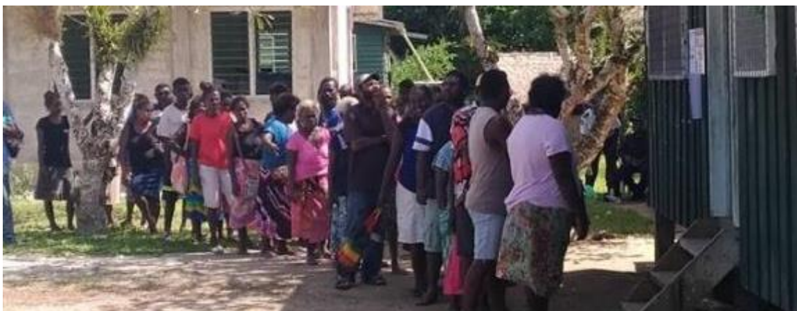
Pic 01: People are waiting in the queue to cast their votes

During the voter registration update for Choiseul and Western Province, the involvement of three SECSIP BVR consultants was instrumental to enable a more dependable functioning of the BVR system and contributed to the identification and recommendations for IT risk mitigation measures. These consultants provided technical advice and help desk assistance at field level and worked on daily maintenance of BVR equipment, including update and integration of data into the system as per request, and solutions to technical issues experienced by the EO IT department. They designed an electronic checklist form in order to conduct the verification process of the existing registration kits. Upon arrival of new BVR equipment in March 2018, BVR consultants conducted the technical inspection of the equipment including configuration and networking of the server and configuration of network switches and UPS.