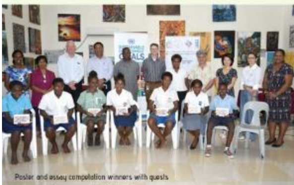
Poster and essay competition winners with quests