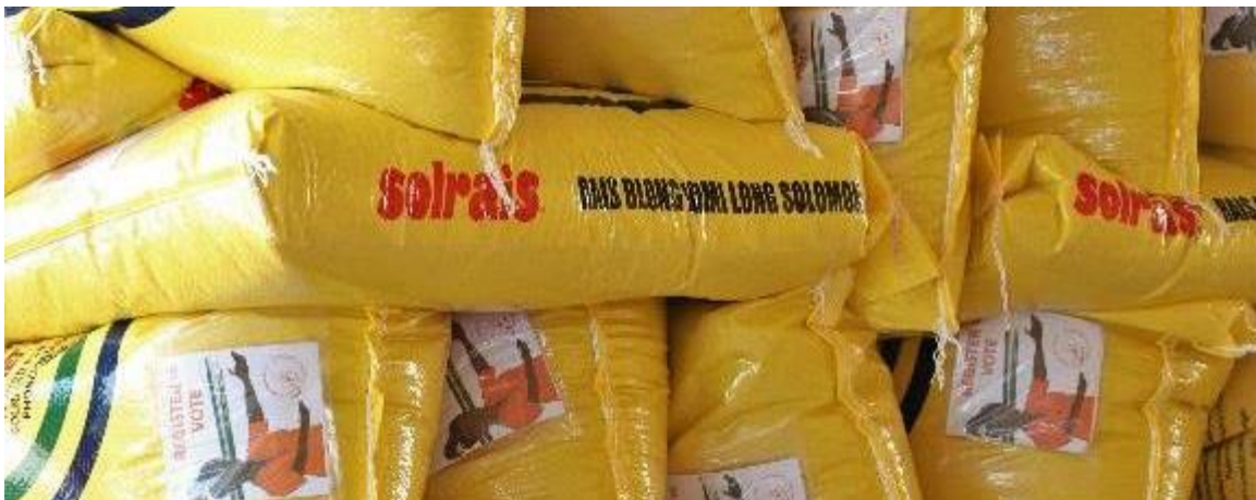
Pic 02: Leaflet on voter registration affixed with SolRice bags.

On 30 May 2018, SECSIP and SolRice, the country's leading distributor of rice, signed a Memorandum of Understanding (MOU) to collaborate on a pro-bono basis for the dissemination of voter awareness materials. SolRice helped the project maximize outreach through its extensive distribution networks around the country by disseminating 110,000 voter awareness leaflets ahead of voter registration. The Association of People with Disabilities (PWD) supported this activity by inserting leaflets into the self-adhesive envelopes adhered to 40lb bags of rice.