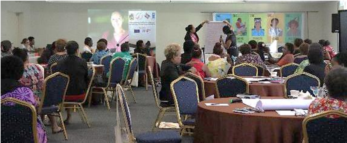
Pic 03: Participants are presenting group works in the regional workshop (August 2018)

The plan has a three-phase approach (pre-nomination, nomination and post-election) prioritizing activities to contribute to the improvement of women's leadership and political skills for national and provincial elections.